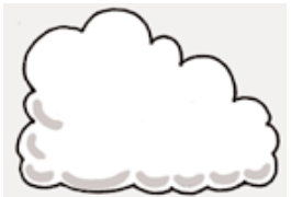
Cumulonimbus, 2 miles