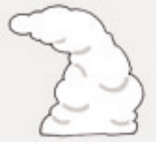
Anvil, 8 miles